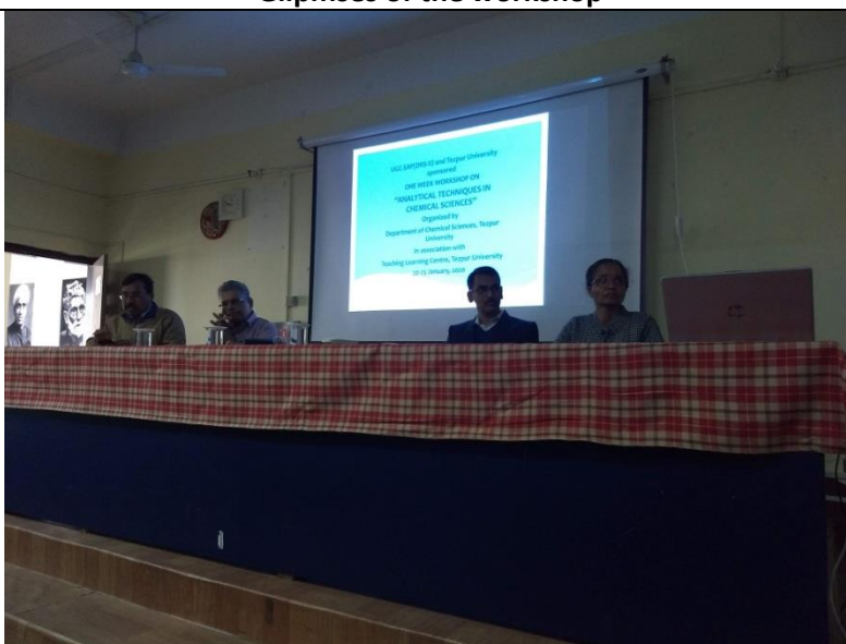
Innuguration during the workshop