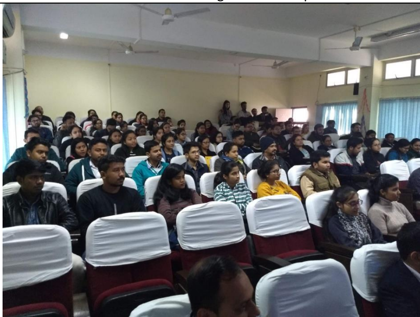
Praticipants during the workshop